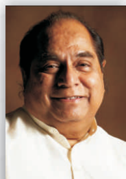
Founder Chancellor Padmashree Dr.D.Y.Patil

As per 30th World Health Assembly resolved in May 1977, "HEALTH FOR ALL BY 2000" is the social goal for all. Keeping this in mind, the D.Y.Patil Groups forays into healthcare and education extends back to over two decades and today stands as benchmark that other aspires to emulate.